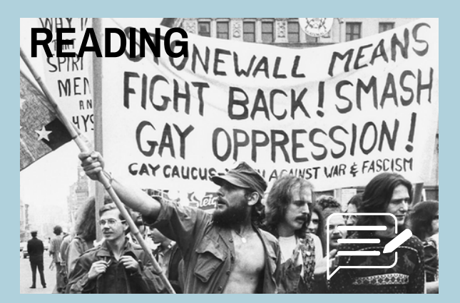
What Happened at the Stonewall Riots? A Timeline of the 1969 Uprising | History.com

How the Stonewall Riots Sparked a Movement | History.com (4 min)