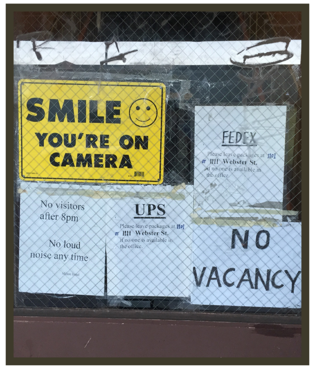
Nearly all residential hotels have "no loitering" signs, surveillance cameras, and heavily secured entrances and exits.

in public, especially in front of the liquor store adjacent to the hotel. The 2004 SRO study similarly identified the Harrison Apartments as a hub of loitering. The Harrison Apartments are owned by Resources for Community Development (RCD), a nonprofit housing developer. An asset manager at RCD reported that the organization is aware of the loitering problem outside the hotel. The asset manager attributed the problem partly to the fact that residents have few other options for where to go; the units are very small and lack amenities, there is no lobby or common area at the hotel, and