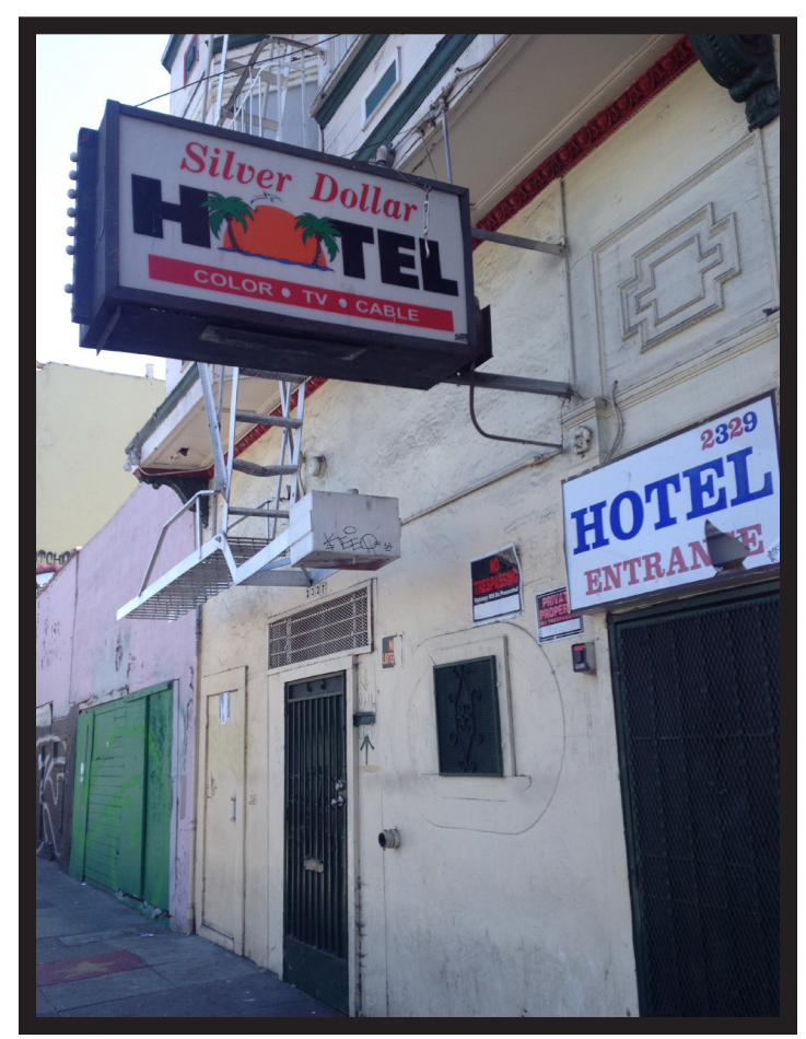
Left: The Silver Dollar Hotel, at 2329 San Pablo Avenue, has been repeatedly identified as being associated with crime. The hotel also has a high rate of vector control complaints. Right: A sign warns, "THIS PROPERTY IS PROTECTED BY SURVEILLANCE CAMERAS" at the New Fern's Hotel.

Some hotels charge a small fee (typically $5 to $10) to residents who bring guests into his or her room. Because questions about visitor fees were not included in the hotel survey, it is not known how widespread the practice is; however, at least one hotel, the Sutter, has previously indicated to city staff that they do charge the fees. The reason for such fees is a matter of dispute. Visitor fees may be a method for hotels to tacitly condone and profit from drug dealing or prostitution among residents. The Sutter Hotel, however, firmly insists that they were directed to charge the fees by the Oakland Police Department, as a way of preventing illegal activity. The beat police officer for the area was unfamiliar with the practice of visitor fees and was not aware of any directives by the police department in this regard.