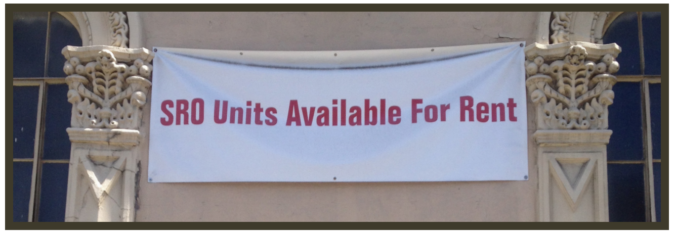
A sign advertises "SRO Units Available For Rent" outside the Claridge. Vacancies are an anomaly among SROs currently - most residential hotels in Oakland are at or near full capacity.