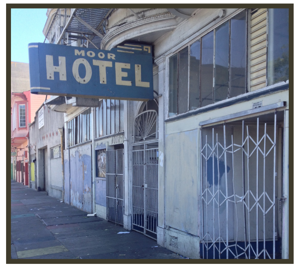
The Moor Hotel has been shuttered since prior to the 2004 report.