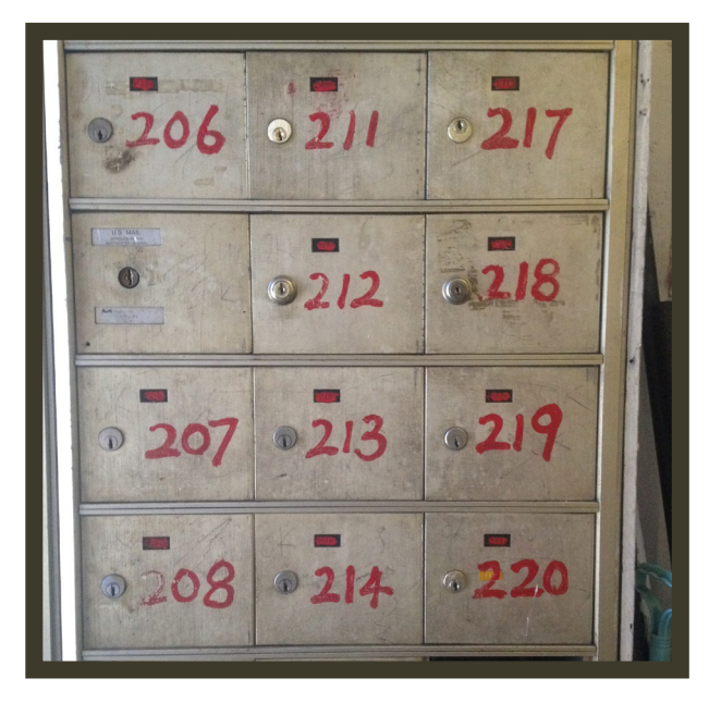
Private mailboxes at the Fremont Hotel. Roughly half of all SROs have private mailboxes, while the rest keep all mail behind the front desk, to be distributed by the desk clerk.

Under city law, guests who stay longer than 30 days are considered permanent residents. This entitles them to certain legal protections: they cannot be evicted without just cause, and rent increases are tied to inflation. For this reason, some hotels have instituted a policy of not allowing new guests to stay more than one month (or 28 or 21 days, in certain instances). Long-term tenants at these hotels are grandfathered in as permanent residents, while new guests are limited in their stay. The Hotel Travelers is one such example--fifty of the seventy units are occupied by permanent residents, while the remaining units are dedicated to short-term rentals.