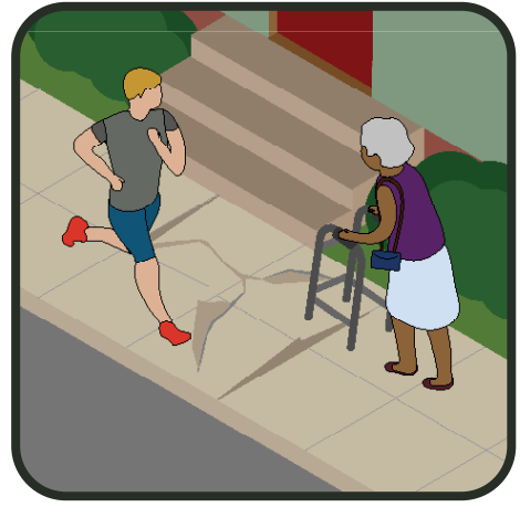
Damaged sidewalks create trip hazards for our neighbors.

Sidewalk Permits from the City are required for sidewalk repairs larger than 25 square feet. A licensed contractor should perform all other repairs. Permits can be obtained at 250 Frank H. Ogawa Plaza, Suite 4344, Oakland, CA 94612 or online at www.oaklandca.gov/topics/engineering-services.