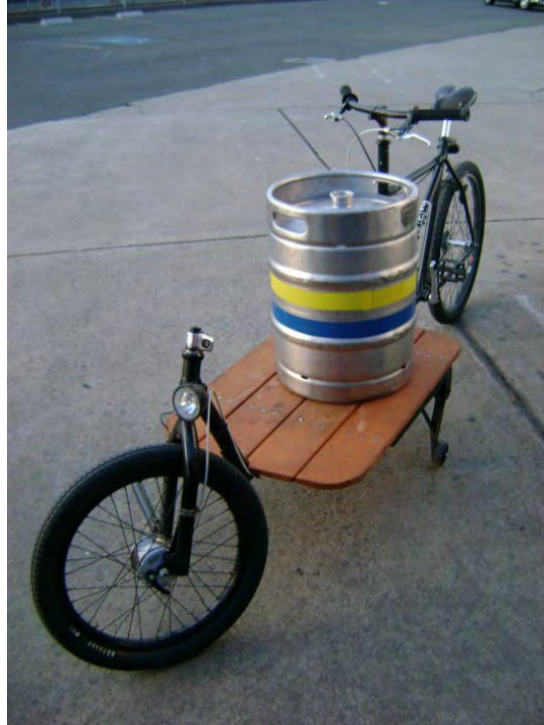
2010 – Refreshments for Bike to the Movies Night , organized by Walk Oakland Bike Oakland (WOBO), an organization founded in 2007 that continues to advocate for walking, biking, social justice, and fun.