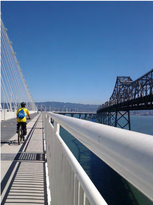
2013 – The New Eastern Span of the San Francisco-Oakland Bay Bridge opens with a 15.5-foot bicyclist and pedestrian path, with 2.2 miles of path on the bridge with an additional 2.7 miles of new path providing access to the bridge.