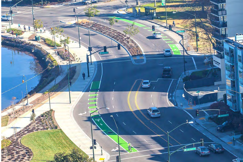
2013 – Oakland Rolls Out Green Bike Lanes with an emphasis on conflict zones, calling attention to where drivers merge across bike lanes and where a bike lane may have motor vehicle traffic on both sides.