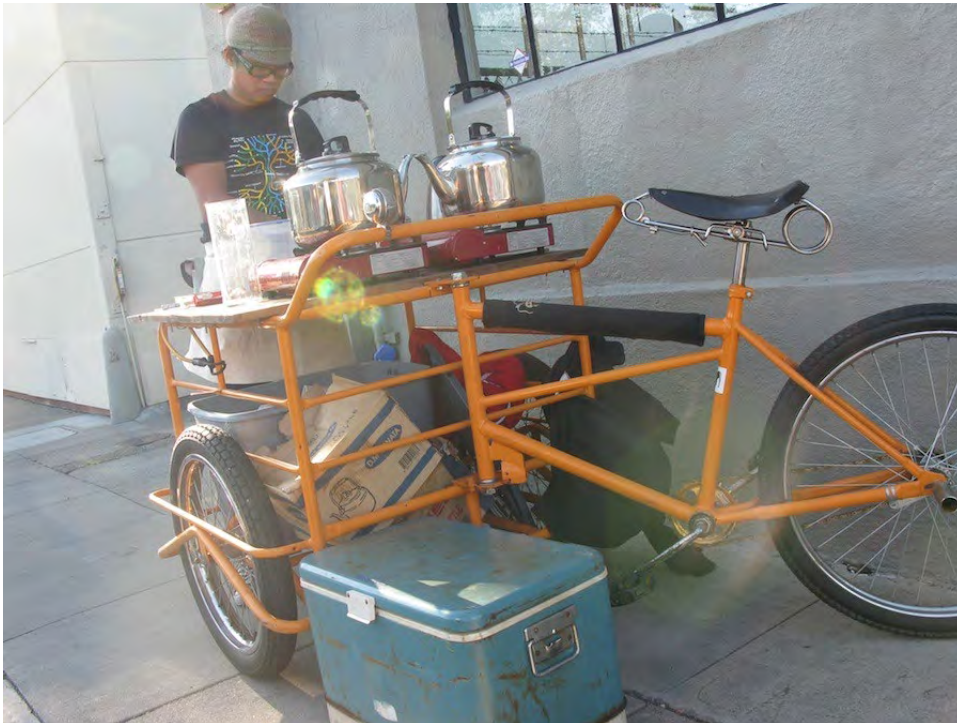
2010 – Bicycle Coffee Takes It to the Streets , founded in Oakland in 2009, and delivering beans by bicycle.