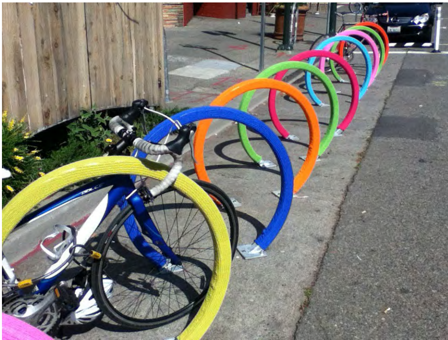
2013 – A Yarn-Bombed Bike Corral brings color and joy to Telegraph Ave in Oakland's Temescal District. Oakland's first bike corral was installed in 2012 with 32 corrals installed to date.