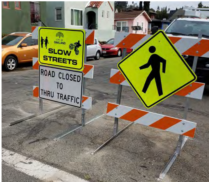
2020 – Oakland’s Slow Streets & Essential Places Program made big news early in the pandemic for closing 21 miles of streets to through traffic and creating neighborhood spaces for residents to recreate during the dark days of shelter-in-place. The program sparked tough questions regarding race and class: who got to stay home; who had to go to work; who needed to drive; and what it would take to redesign streets as more inclusive public space.