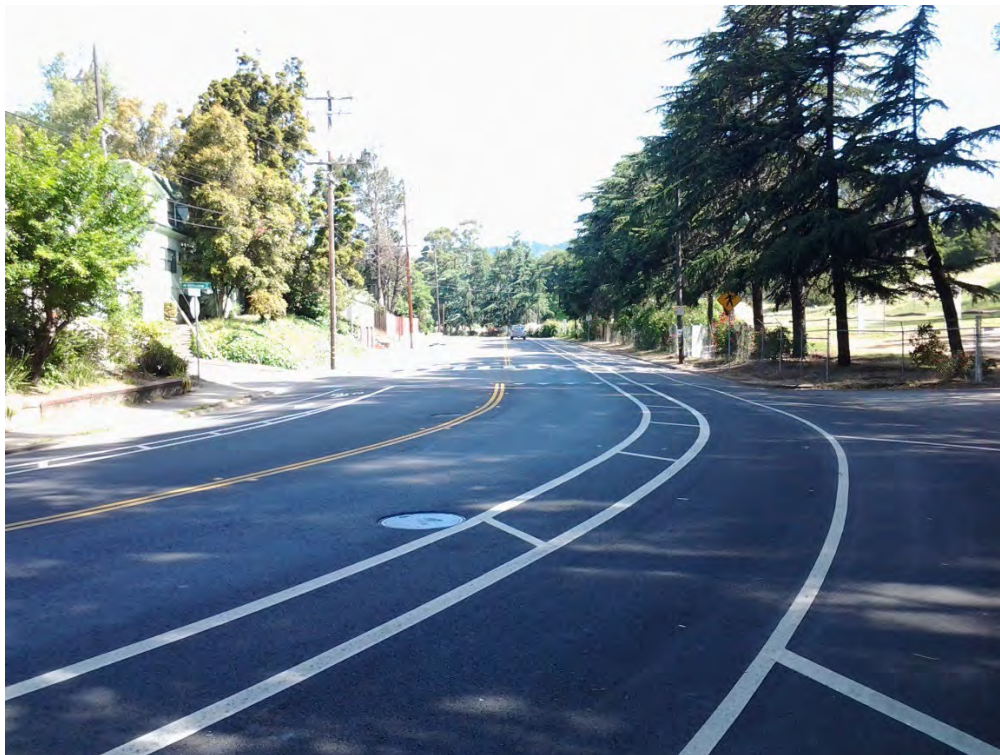
2014 – MacArthur Blvd’s 4-to-2 Lane Road Diet at Mills College marked a turning point for installing buffers on bike lanes rather than two-way center turn lanes when reconfiguring roadways. Since 1995 Oakland has completed 95 road diet projects on 57 miles of streets.