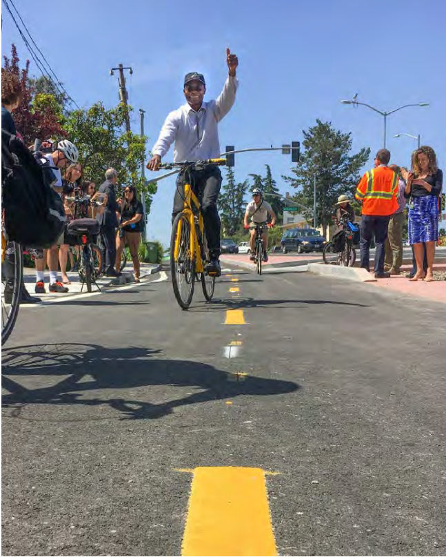
2017 – Oakland’s First Concrete-Separated Bike Lanes , on ribbon-cutting day, along Broadway at Keith Ave, one of a collection of bicyclist and pedestrian improvements funded by an Oakland settlement with Caltrans over the Fourth Bore of the Caldecott Tunnel on California State Highway 24.