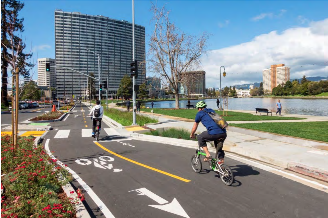
2018 – Oakland’s Showcase Separated Bike Lanes , on Lakeside Dr along Lake Merritt, have set a high bar for how enjoyable and attractive separated bike lanes can be.