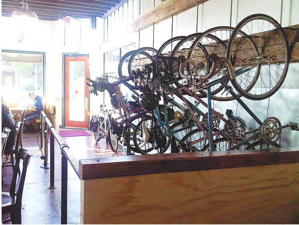
2010 – Actual Café Takes Bike Parking Inside beginning a new trend for bike-supportive local businesses to show their love for bicycling customers.